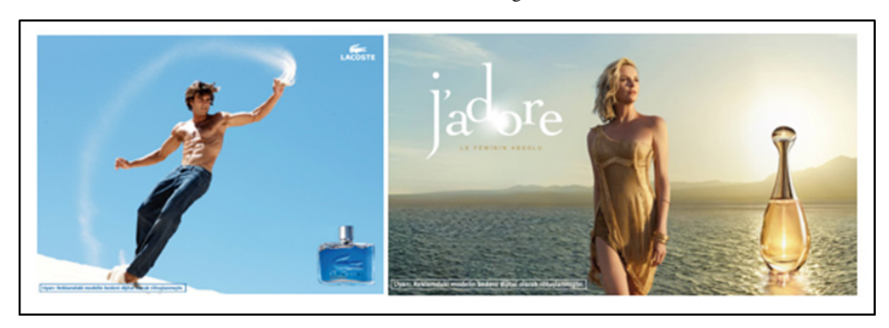
Figure 1. Selected Ads with Disclaimer Label

Six different print advertisements were selected for the male and female groups. Each advertisement included male/female models and all models' body are visible. Six different selected ads were shown to 20 male and female students, and afterwards, a questionnaire was applied. The participants were asked to score each ad form 1 to 7 in terms of the criteria of "fascinating", "attractive", "irritating" and "has ideal body". After ranking the ads, the highest-rated ads were selected. Then, the disclaimer label was inserted in one ad (see Figure 1). In the advertisement shown in Figure 1 "Warning: The body of the model in the advertisement is digitally modified" was written. The advertisements without a disclaimer are shown in Figure 2.