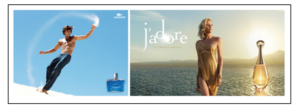
Figure 2. Selected Ads without Disclaimer Label