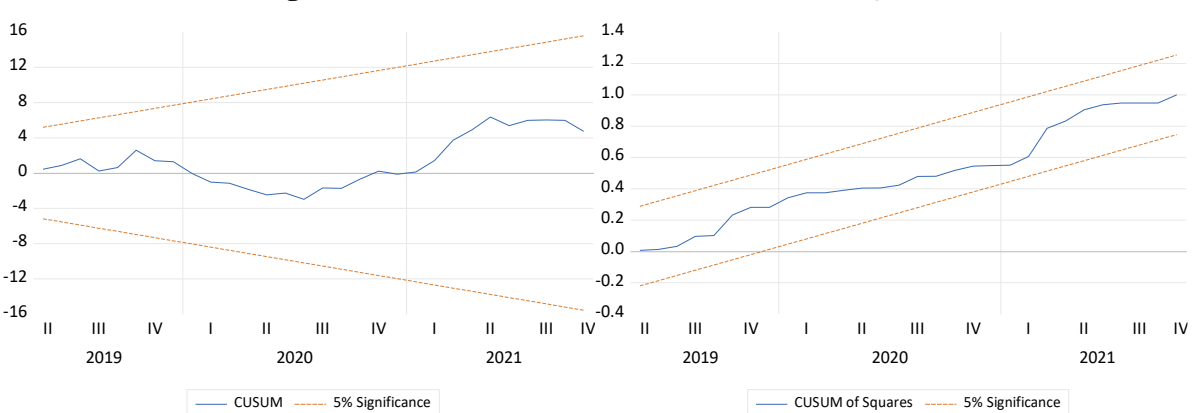
Figure 2. The Results of CUSUM and CUSUMSQ Tests

As seen in the figure 2, the graph of the CUSUM and CUSUMSQ tests falls within the 5% significance level. This shows that the obtained long-run coefficients are stable. Since the effectiveness of the model is determined, we can now proceed to interpret the long-term coefficients.