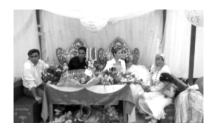
Lunch and Dances

After leaving the park, our photo/videographers took a 'fly on the wall' style as opposed to their central position in the outdoor shootings. In the two hours when we were out for outdoor shootings, the entire guests had arrived: The ceremony officially started when the wedding singer announced he couple's entrance. There were more than 200 guests in the hall; they all stood up and applauded the couple. The couple walked through the hall, and after the groom presented a "yüz görümlüğü" to the bride, they were invited to their first dance by the wedding singer. Apparently, the groom did not want to dance saying he was ill and tired, but the wedding singer nicely forced him by telling this wedding was recorded; that the groom's future children would like to see their parents' first dance. This was quite convincing for the groom, he accepted to dance with her wife for the cameras.