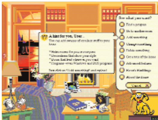
Figure 5: "Bob's Living Room" (Lineback 1999: 190)

Microsoft's operation system - dating back to 1995 - "Bob's Living Room", can be considered as a corresponding example. In this GUI, an extended metaphor of a living room was introduced and it could be personalized (redecorated) according to the user's demands. But an over-literal interface environment like Bob wasn't indeed a metaphor but rather a simulation. Johnson makes a distinctive evaluation on the case of "Bob's Living Room": "Bob represents the domestication of the personal computer, in the pejorative sense of the world, turning the miraculous shape-shifting capacities of these machines into a dulled repetition of everyday, household reality. The real magic of graphic computers derives from the fact that they are not tied to the old, analog world of objects" (Johnson S.,1990: 61).