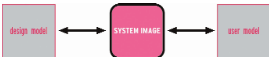
Figure 1: Three aspects of mental models (Norman 1988: 190)