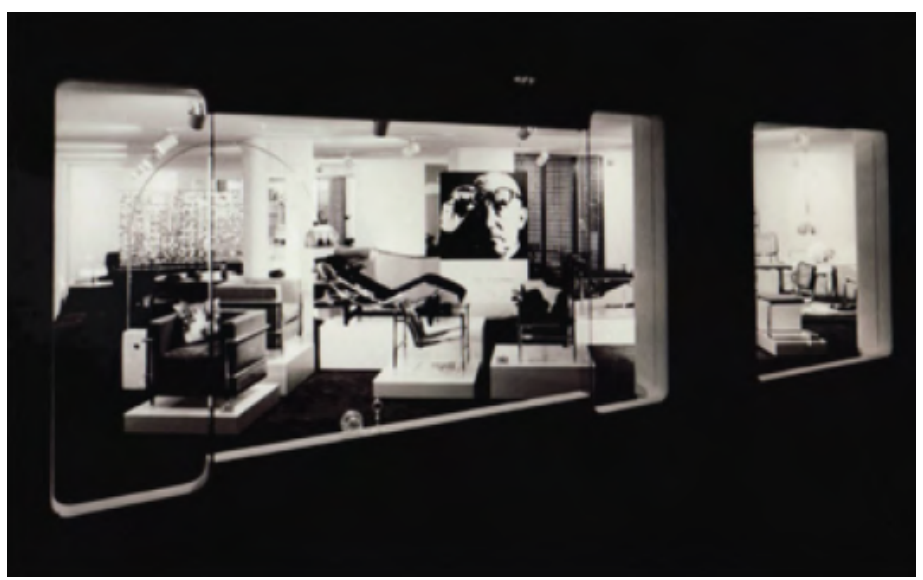
Figure 6. Interno Showroom, Nişantaşı, Istanbul.

come to be a hallmark of the company as its home over 30 years. With the reproductions of furniture designs by early modernists such as Breuer and Corbusier, authentic designs brought to life by company partners through these influences, and the selection of contemporary accessories assembled with the professional care, Interno soon turns into a kind of unique modern design museum in Turkey. This multidisciplinary presentation of designs not only offers a detailed perspective of contemporary life to its customers but also serves as a role model in İstanbul regarding store marketing. Adopting an approach far ahead of its time, Interno lays the foundations of both a modern understanding of space and a modern furniture industry that did not entirely exist at that time. These bold design attempts, which date to a trying period in Turkey with import bans and scarcity of technology and material, contribute to training many craftspeople in Turkey (Karakuş, 2007).