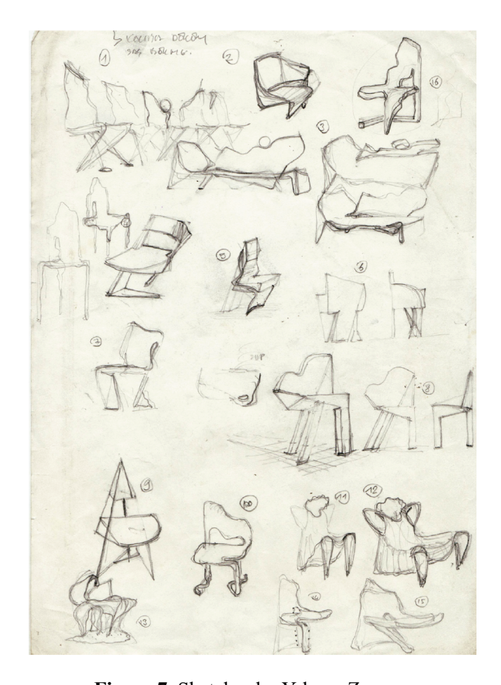
Figure 7. Sketches by Yılmaz Zenger.