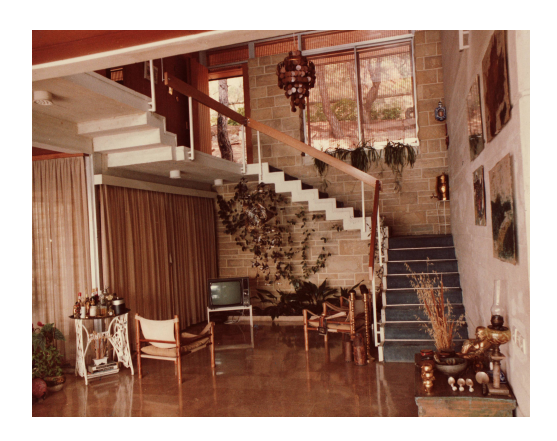
Figure 8. Kamhi-Grünberg House, Burgazada. Design by Utarit İzgi.