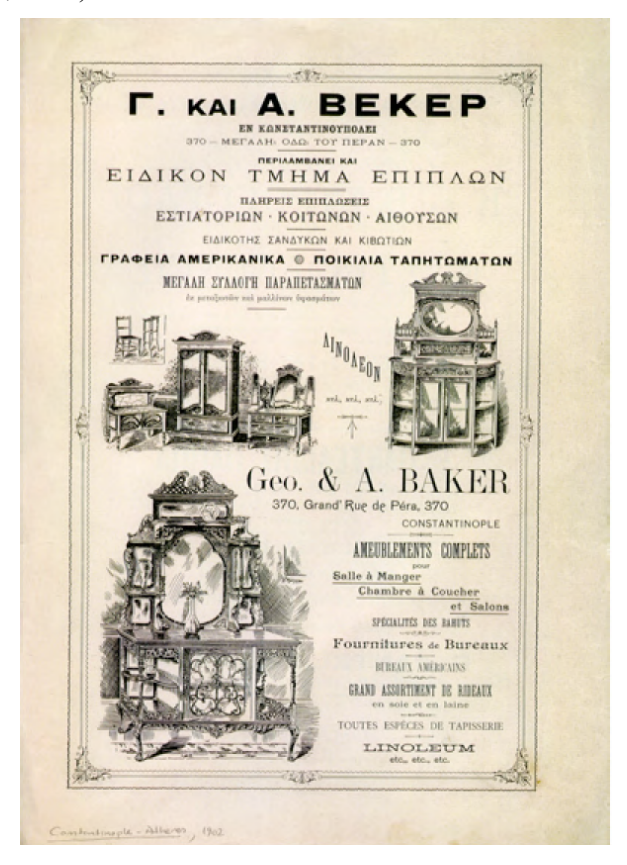
Figure 1. Maison Baker Ad, 1902.

"Maison Baker" Furniture Store in Beyoğlu chain store, owned by British George Baker, who settles in Istanbul in 1856 following the Crimean War and his sons, does not manufacture furniture. The stores sell several different goods made in England, ranging from furniture to fabric, haberdashery to sports equipment. This chain store, which has one branch in Tünel and three on İstiklal Avenue, is liquidated in the 1950s (Uzunarslan, 2002).