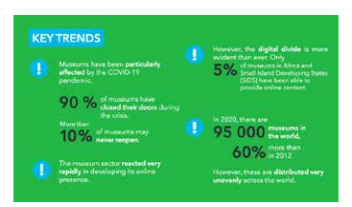
Figure 1. "Key Trends" presented by UNESCO (UNESCO, 2020, p.4).

The need for museums to use technology effectively and increase their digital capabilities has become central to discussions in the field of cultural heritage with the global COVID-19 pandemic (Karadeniz, 2020, p. 984). Through their reaction to the pandemic, museums worldwide have sought to be fast and constructive, turning their attention to resolving challenges within their societies in this circumstance (NEMO, 2020). Hence, by growing their digital services to connect audiences who remain at home, museums have responded as quickly as possible to reduce the feeling of alienation and loneliness (NEMO, 2020). Either by presenting or re-presenting their previously digitized resources or creating new contents including online exhibitions, virtual tours, online educative