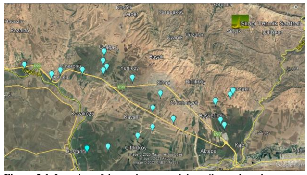
Figure 2.1. Location of the study area and the soil samples taken on the map

20-23 km, D6: 23-26 km, D7: 26-29 km) and at 3 different points (21 soil samples) and 2 different depths (0-30 cm and 30-60 cm) in each distance class (Figure 2.1).